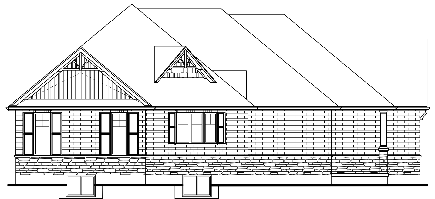
RIGHT SIDE CORNER ELEVATION